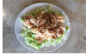
Shrimp w/ Honey Walnut