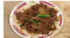
🔥 Mongolian Beef