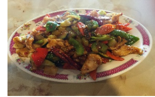
🔥 Kung Pao Chicken