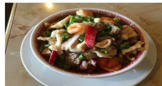
Combination Won Ton Soup