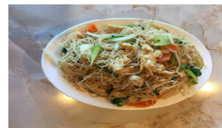
Chicken Rice Noodle