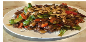
🔥 Kung Pao Beef