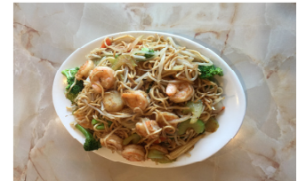
Shrimp Lo Mein

Served with pan fried noodles and vegetable